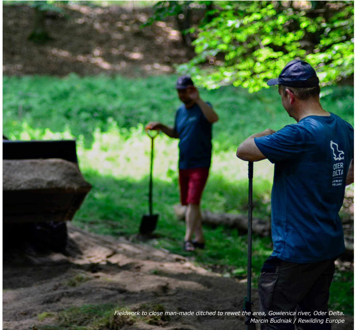
Fieldwork to close man-made ditched to rewet the area, Gowienica river, Oder Delta.

In each case, it is advisable to confirm whether the activity planned by a rewilding practitioner is included in the list of developments referred to above.